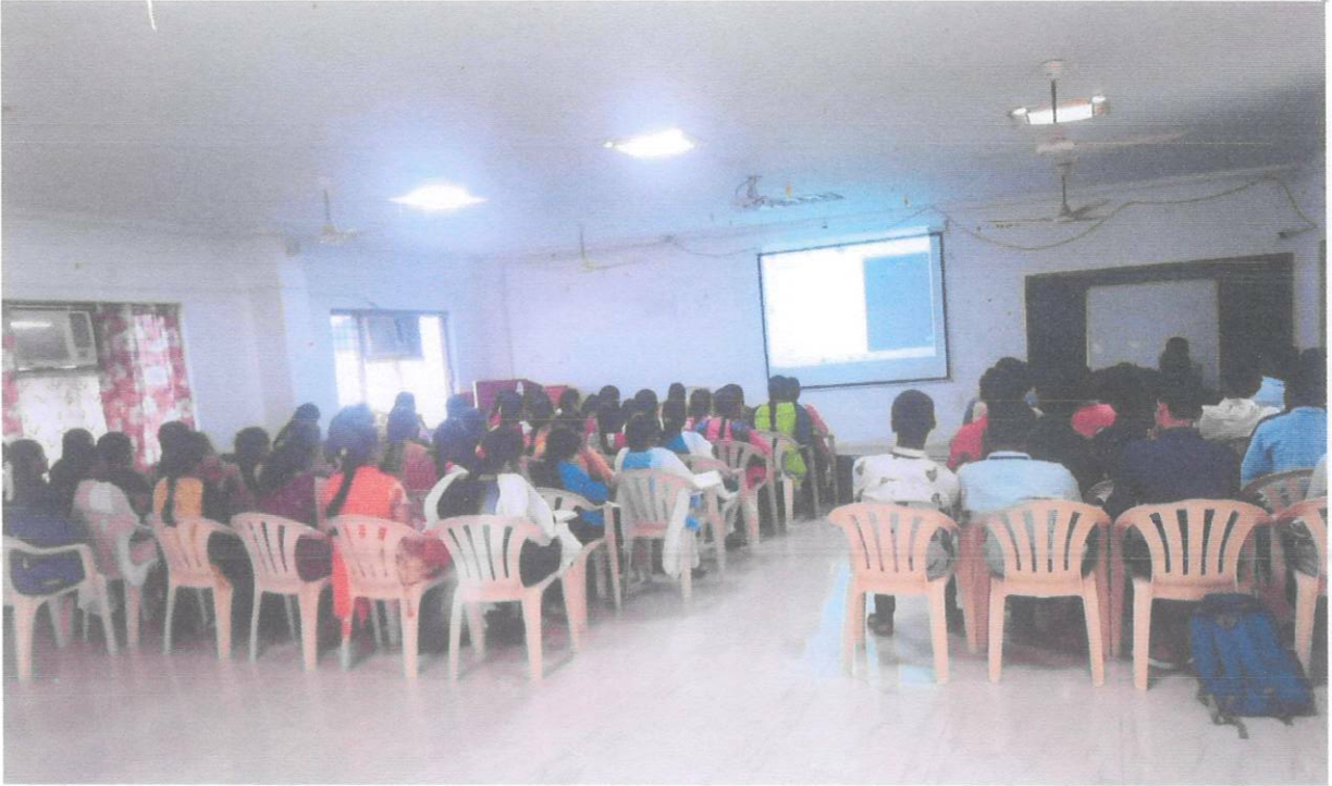
Mr.Rahul training on TENSES & CORRECTION OF SENTENCES