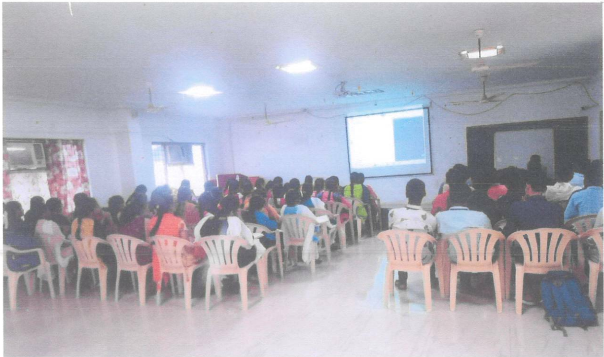
Mr.Rahul training on TENSES & CORRECTION OF SENTENCES